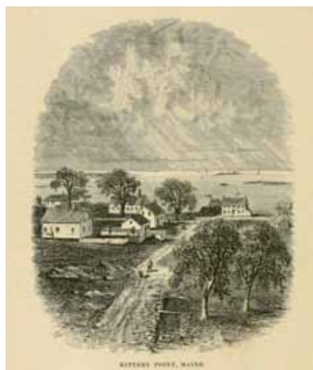
View of Pepperrell Cove from the Pepperrell Hotel. Published in “Nooks and Corners of the New England Coast” by Samuel A. Drake (1875).