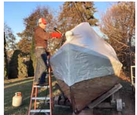
Shrink wrapping the Captain's Gig.