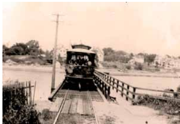
Car No. 35 crosses the bridge from Kittery to Badger's Island.

A few of the spirited town-folk put their heads together and thought it would be a good idea to have town water. So they founded the Kittery water company. Stock was purchased by different individuals and the project came through. Previous to that they all depended on the old fashioned well. Some had sweepstakes, others just the common pole with a hook on it. Many of the wells were half filled up by losing buckets down them and during dry seasons many wells went dry. One would go dry then everybody would flock to the next one with tubs and buckets, till they were all dry. It was a common occurrence to see mothers and children starting out after supper with all the utensils to get a supply of water for the next