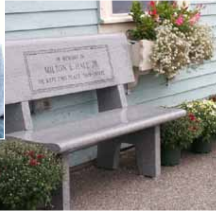
Milton Hall memorial bench.