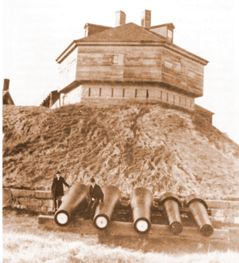
Three 15-inch Rodman guns and two 10-inch Parrott Rifles at Fort McClary, dismounted, circa 1900.

“FORT MCCLARY is being put in condition to protect this harbor in case of an emergency. Engineer Walker is at the fort and a large amount of lumber was hauled there yesterday and the guns which are of the same improved type and landed just at the close of the civil war are 8 inch rifles and 15 inch Rodman guns which are capable of throwing a 500 pound shot and would be capable of keeping a foreign fleet several miles from our coast. It is understood that four 8 inch modern guns are now on the way here and will be mounted at Gerrish’s island.”