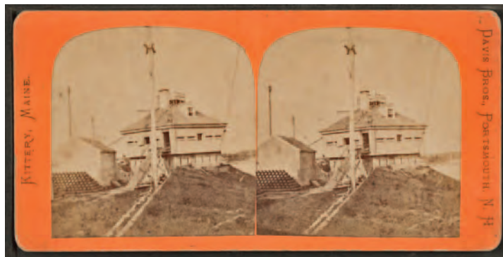
Blockhouse, Fort McClary, Kittery Point, Maine.

Fort McClary is now a beautiful state park and museum, used for recreation, historical re-enactments, musical events, picnics, and just watching the maritime activities at the mouth of the Piscataqua and out to the Isles of Shoals. The Fort is owned and maintained by Maine’s Bureau of Parks and Recreation. But the Fort is