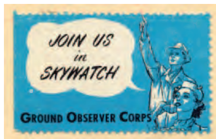
Civilian 1950s Skywatch recruitment sticker. (Wikipedia)

Riley seeks 800 volunteers to man the Kittery spotting tower in connection with the Air Force-Air Warning Service “Operation Skywatch.” The tower is located at Fort McClary.