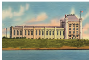
Naval Prison, Portsmouth (NH) Navy Yard

Built to hold a maximum of 36,000 soldiers, Camp Devens is now crammed with over 45,000 soldiers, most of whom have been recently assigned there from Maine and other New England states after the draft was expanded from 21 to 35 year old men to include any healthy men ages 18 to 45 years old.