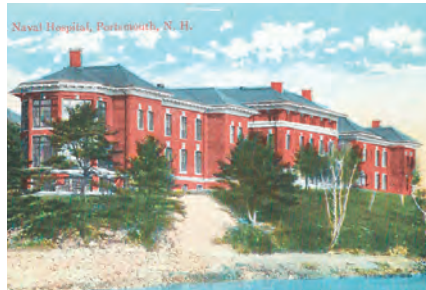
Naval Hospital, Portsmouth (NH) Navy Yard

Maine sent young men from all over the state to train at Ft. Devens in Massachusetts, one of the first sites