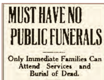
Portsmouth Herald, Sept. 25, 1918