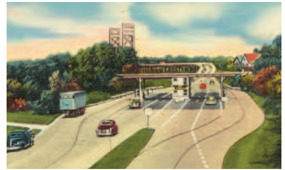
Hand-colored postcard depicting the toll booths, collecting 10 cents per car, on the New Hampshire side of the Interstate Bridge, circa 1940.

After the opening of the high-level bridge in 1972, the Sarah Mildred Long Bridge continued to carry mostly local traffic, but its age had begun to show. In Kittery, the rail tracks for carrying goods and passengers closed and only the Shipyard branch still operated. In 2013, a large tanker struck the SML bridge, causing structural damage and a temporary close-