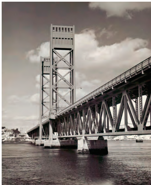
The Route 1 by-pass crosses the Piscataqua River over the Maine-New Hampshire Interstate Bridge, circa 1940s.

A second bridge, the Memorial Bridge, was opened in 1923 and almost immediately nearby streets in