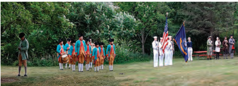
Kittery celebrated Independence Day on June 26, 2021 with appearances by the Piscataqua Rangers Junior Fife and Drum Corps, the Portsmouth Naval Shipyard Color Guard, Revolution-era reenactors from Capt. Henry Dearborn's Company, and members of the Daughters of the American Revolution. Kittery native "General William Whipple," shown at left studying his speech, gave a reading of the Declaration of Independence. After the ceremony, the Society invited everyone to enjoy the museum.

Not yet a member? We would love for you to join! Go to our website or click on this link: