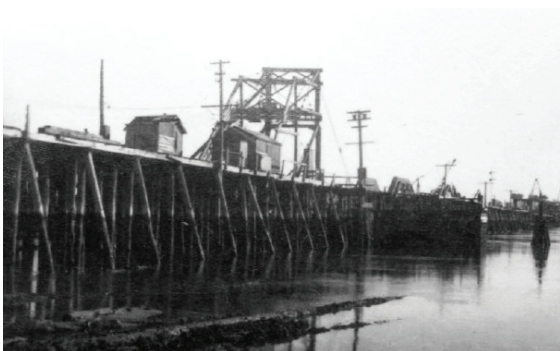
The pile bridge over the Piscataqua River before its closure in 1939.