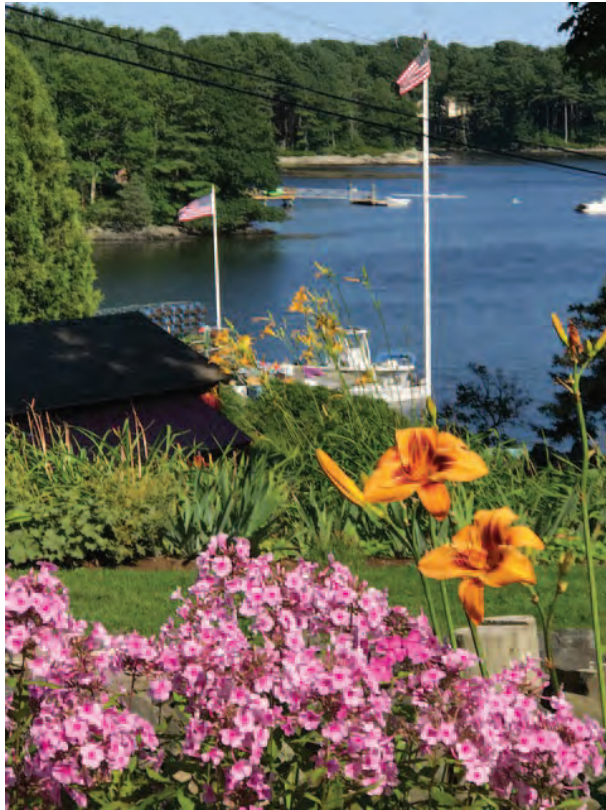
Colorful blooms frame a view of Fernald Cove. Gardens on Moore's Island Lane will be on the tour.

Plans to celebrate the 375 th anniversary of Kittery's incorporation include "Kittery Seaside Gardens Through the Centuries" and the reprinting of John Frost's book Colonial Village.