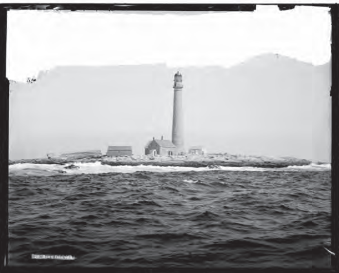
Boon Island Lighthouse, circa 1905-1920. From a glass plate negative