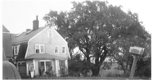
THE THAXTER HOME ON CITTIS ISLAND WITH THE CHAMPINGWINE FIRM IN FRONT.

KITTERY HISTORICAL & NAVAL SOCIETY 2017 CALENDAR