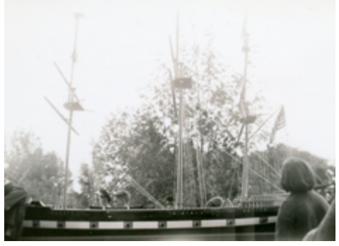
Model of the USS Ranger, which is now on display at the Museum.