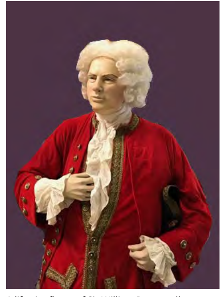
A life-size figure of Sir William Pepperrell, impeccably costumed by the talented Ron Ames.