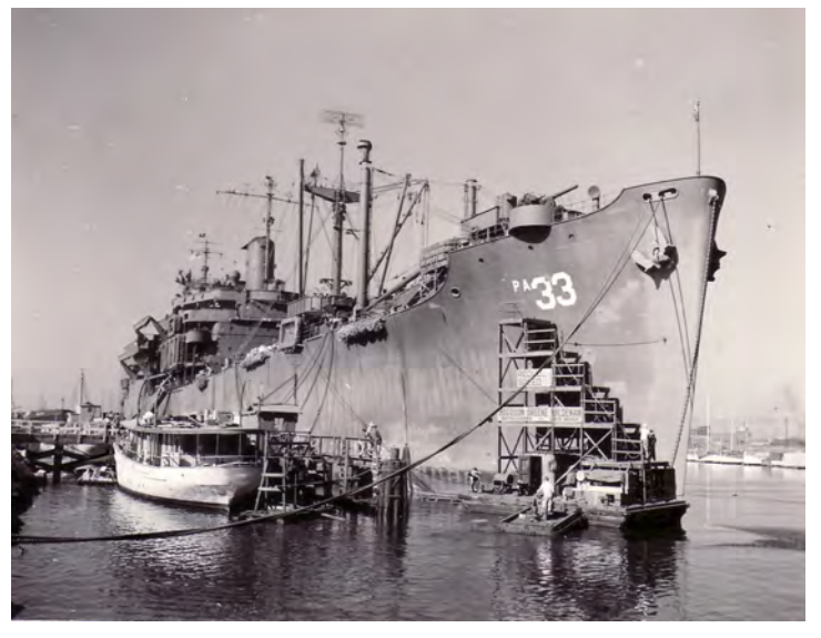
Armsden's photo of the USS Bayfield at anchor in Long Beach, California the ship he served on in the Pacific during WWII.